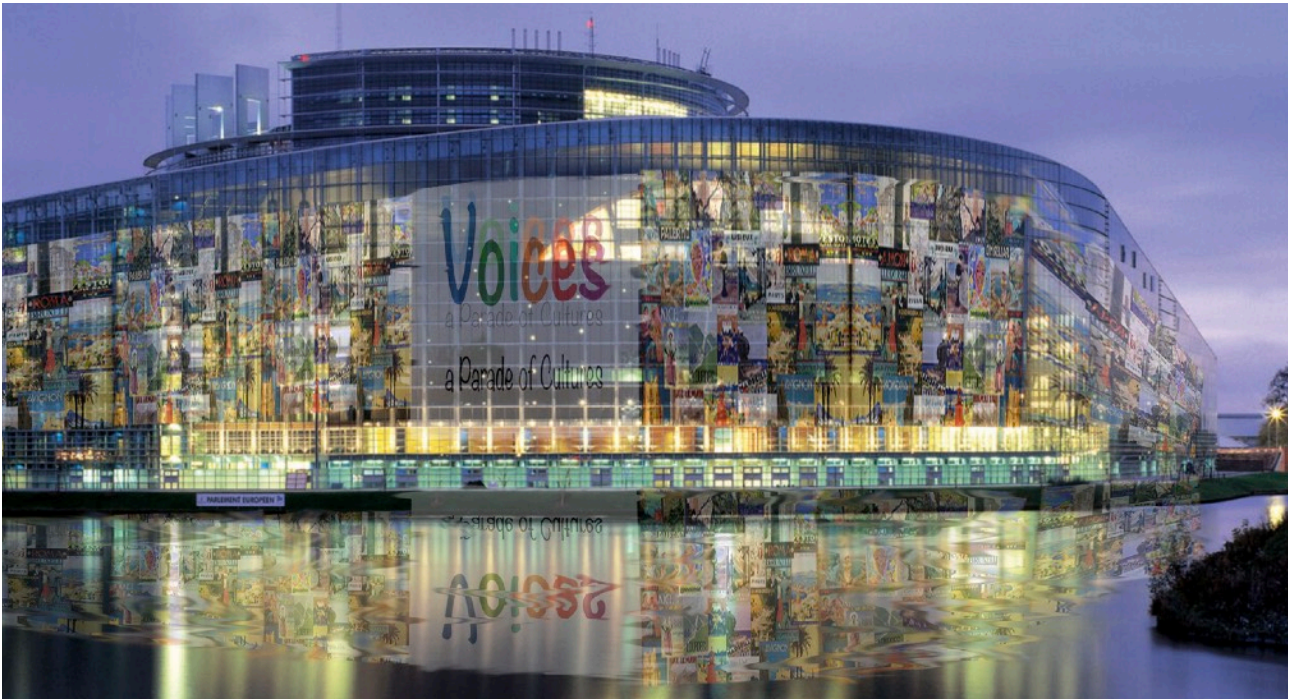
Animation of a collage of cultural expressions on translucent films on the south facade of the European Parliament in Strasbourg.

Voices is a multicultural participation project initiated by Cult Foundation Amsterdam. Cult promotes and stimulates projects of site-specific art and performance in public space all over Europe. For 2026 schools and local communities are invited to visualize their cultures by making a panel, quilt or flag. In this document a step by step instruction how to start, make and submit. And how we expose your work.